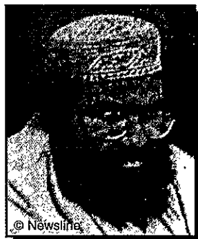
Maulana Masood Azhar, Jaish-e-Mohammed leader

The United States remains concerned about reports of continued Pakistani support for the Taliban's military operations in Afghanistan. Credible reporting indicates